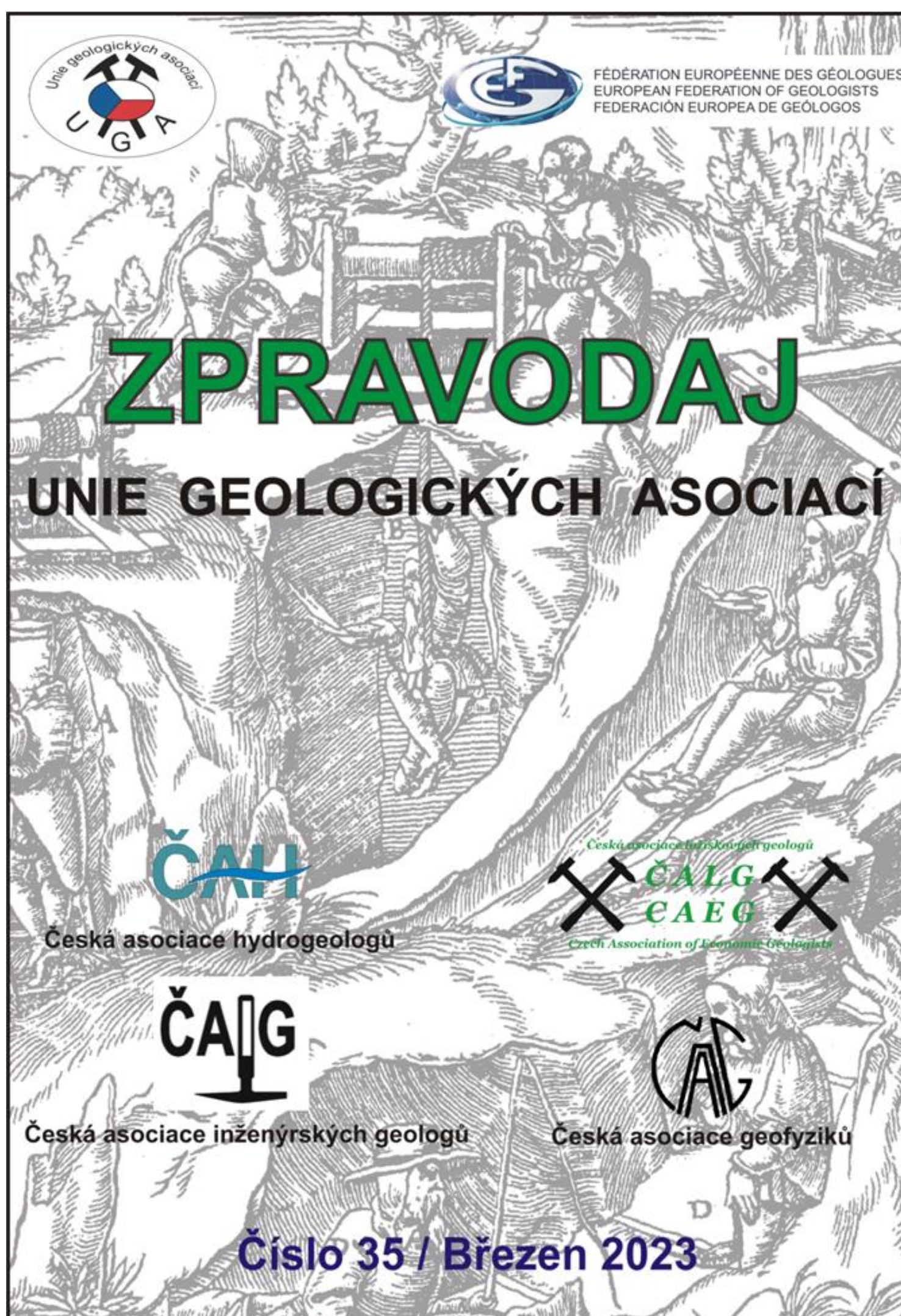
Wrapper of Union of Geological Associations newsletter

Scientific societies represent important unifying platform, both within particular fields and in inter-disciplinary terms. They are the only institutions linking together experts from universities, Academy of Sciences of the Czech Republic, and other departmental research institutions. The Societies are a meeting point of professionals with the public interested in a given field, they are open to students of all school levels and provide them with a possibility of informal meetings with scientists and teachers. The Societies are often of inter-disciplinary character, and some of their scientific interests are even not represented in academic or other scientific institutions. Many of them are the only connection of our scientific public with international scientific bodies.